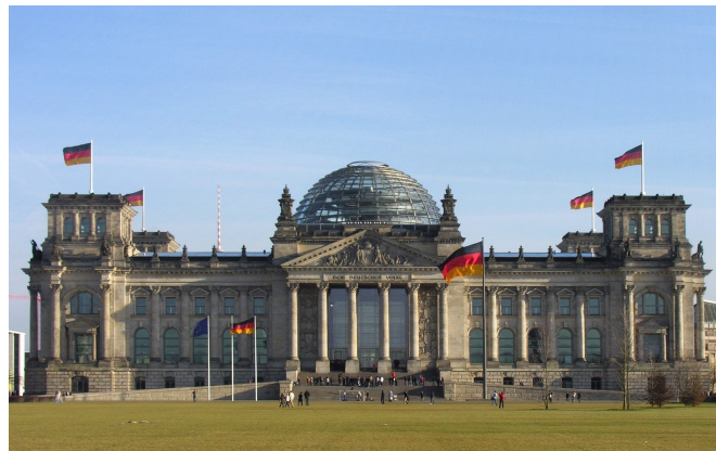
German Bundestag

BERLIN – “Western Balkans to EU” Network (WB2EU) will organize a new discussion on enlargement politics, Under the title “Towards a credible EU Enlargement Policy? What does German “Zeitenwende” mean for the Western Balkans?” . The event will extend the current discussion on EU enlargement policy in the Western Balkans to the broad public in Germany.