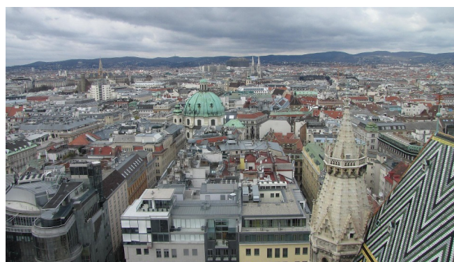
Vienna; Photo: pixabay

VIENNA – The Western Balkans to EU Network (WB2EU) will organize a new discussion on enlargement politics under the title “Is EU Enlargement back on track? Moving towards a democratic and united Europe.”