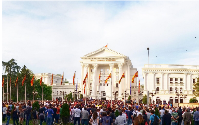
Protests in Skopje 2015; Photo: Twitter / @banekoma

Democracies are under pressure, the rule of law in the Western Balkans and some EU countries has weakened and the current health and economic crises further complicate the search for renewed energies and optimism. This was a conclusion of the panel “New perspectives on rule of law and justice – Where do we stand and what do we need”, organised by the “WB2EU network”.