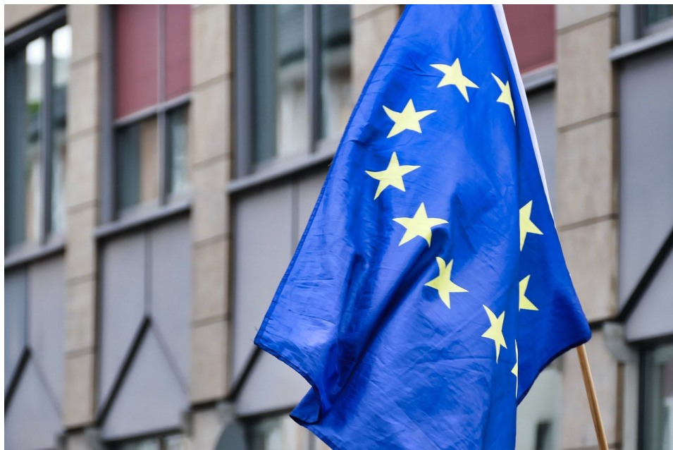
EU flag; Photo: Pixabay

VIENNA – „WB2EU“ Network has published the final publication titled “Vision Western Balkans 2023 – Europeanisation meets democracy” , which contains selected op-eds and policy briefs published within WB2EU Network and the Network’s Next Generation Summer School participants. The articles in the publication focus on all challenges of the WB related to the EU integration process, such as the rule of law, social questions, and democratic developments in the Western Balkans.