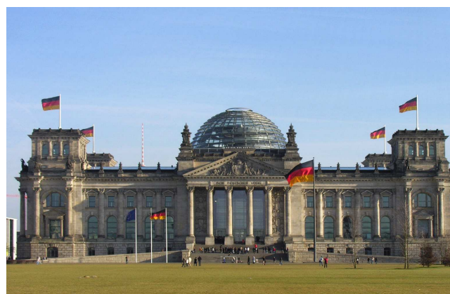
German Bundestag

BERLIN – “Western Balkans to EU” Network (WB2EU) will organize a new discussion on enlargement politics, Under the title “Towards a credible EU Enlargement Policy? What does German “Zeitenwende” mean for the Western Balkans?” . The event will extend the current discussion on EU enlargement policy in the Western Balkans to the broad public in Germany.