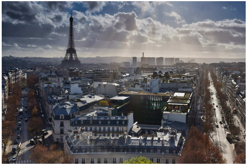
Paris

PARIS – “Western Balkans to EU” Network (WB2EU) will organize an event on the politics of EU enlargement in France in Paris on 19 and 20 May . The event will gather experts from the Western Balkans and the EU countries, to discuss what the novel context in Europe could mean for the Balkans’ path into the EU.