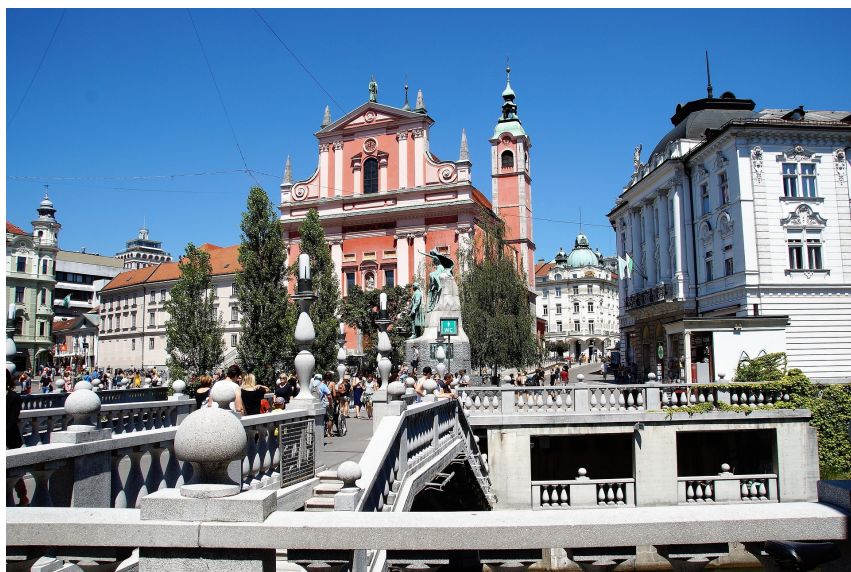
Ljubljana

LJUBLJANA – “WB2EU network” is organising a second public debate “ Is the EU losing the Western Balkans and/or vice versa? ” about EU enlargement process on 14 October in Ljubljana.